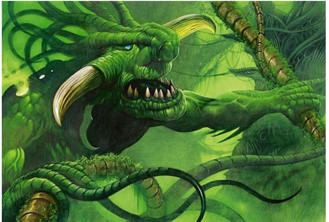
Pulse of the Tangle by Wayne England

And here's the art of Pulse of the Tangle. Note the recognizable curving horns, tentacle fingers and headdress, "shoulder chimneys," and the bullet-shaped nose.