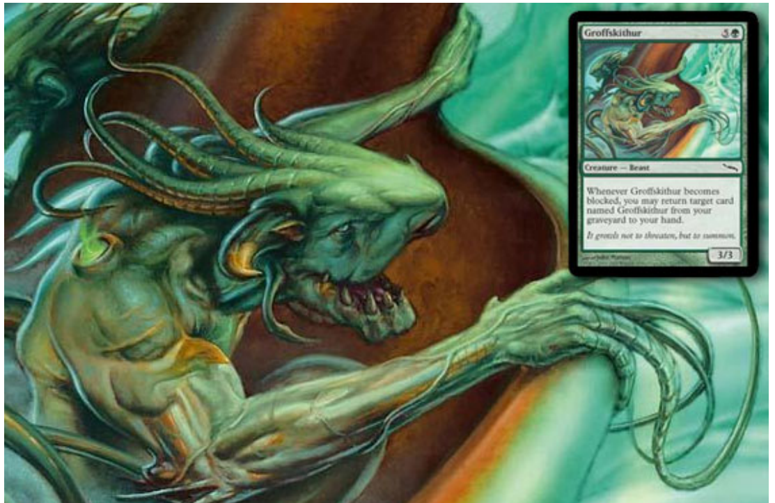
Groffskithur